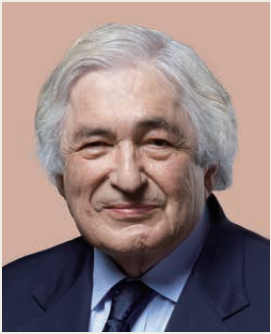
Dr. James D. Wolfensohn Chairman Wolfensohn & Company, LLC