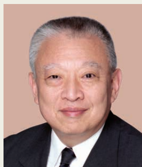
The Hon. Tung Chee-hwa , GBM Vice Chairman 12th National Committee of Chinese People's Political Consultative Conference (CPPCC)