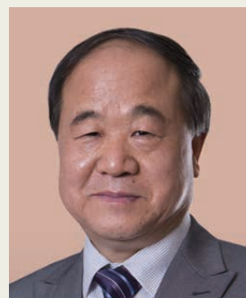
Dr. Mo Yan Laureate of Nobel Prize in Literature 2012