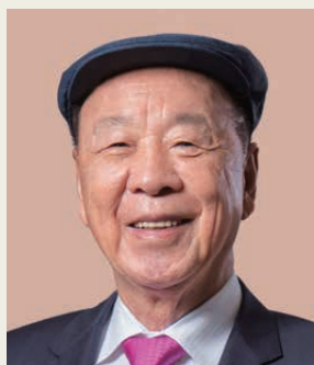
Dr. LUI Che Woo , GBM, MBE, JP Founder & Chairman of the Board of Governors cum Prize Council LUI Che Woo Prize