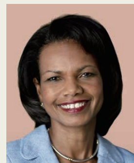
Dr. Condoleezza Rice Thomas and Barbara Stephenson Senior Fellow on Public Policy, Hoover Institution; and Denning Professor in Global Business and the Economy, Stanford Graduate School of Business