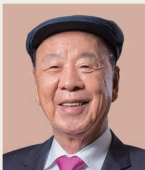
Dr. LUI Che Woo, GBM, MBE, JP Founder & Chairman of the Board of Governors cum Prize Council LUI Che Woo Prize

The Board of Governors is the governing body of LUI Che Woo Prize Limited ("the Prize Company"), a charitable company limited by guarantee incorporated in Hong Kong. The Prize Company is led and supervised by the Board of Governors.