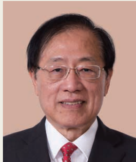
Prof. Andrew Yao Dean, Institute for Interdisciplinary Information Sciences Tsinghua University