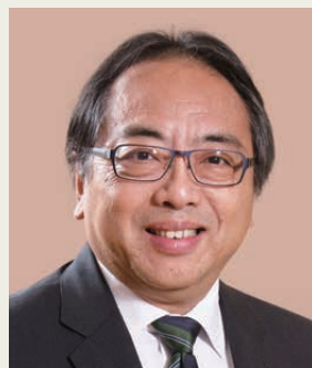
Prof. Lap-Chee Tsui, OC, PhD, FRS, FRSC, GBM, GBS, JP President Victor & William Fung Foundation